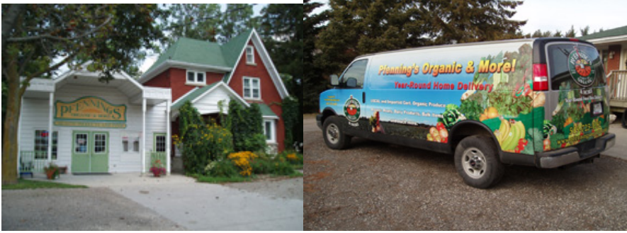
Food Box Delivery

Check out Pfennings Organics & More near the main intersection of the village of St. Agatha for a large selection of organic foods.